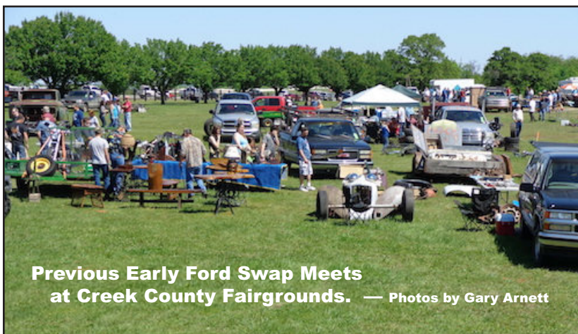
Previous Early Ford Swap Meets at Creek County Fairgrounds.