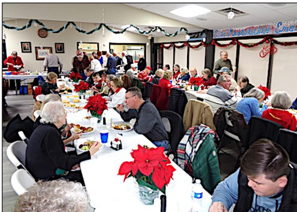
Everyone enjoyed Christmas Dinner, food, fun fellowship. More pics inside.

THANK YOU ONE AND ALL FOR YOUR PARTICIPATION AND HELP IN MAKING THIS EVENT A SUCCESS! AS WITH MERRY CHRISTMAS, WISHING ALL OF YOU A HAPPY NEW YEAR!