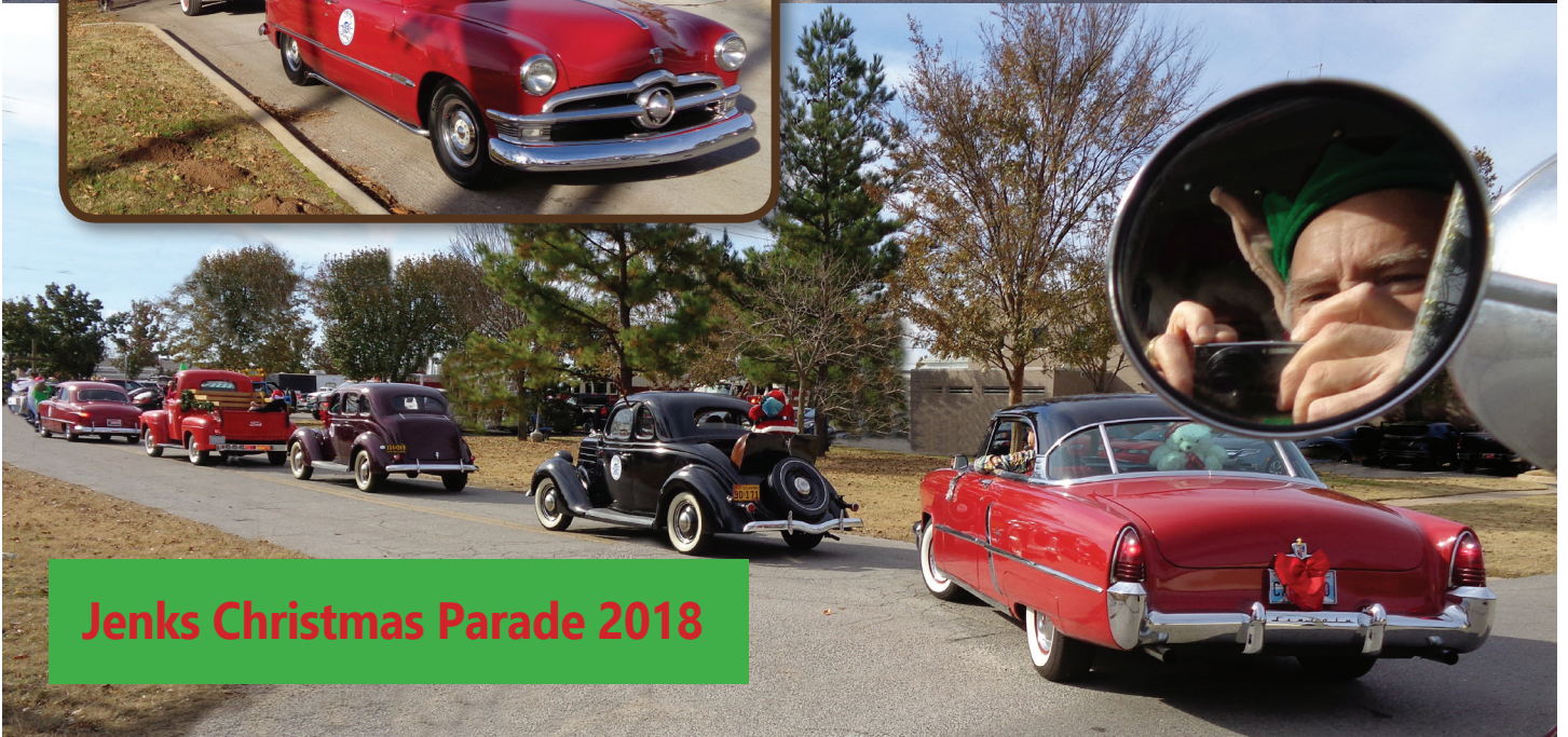
Jenks Christmas Parade 2018