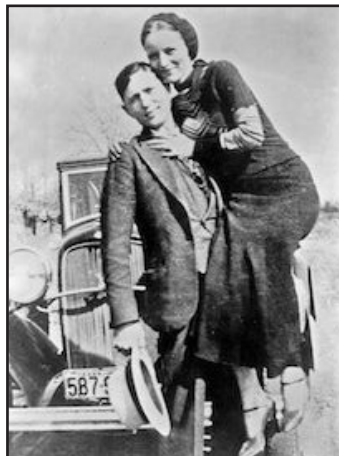
Bonnie and Clyde with hats of yesteryear after stealing Ford!

5. And that could be a fifth thing to do — enter a Bonnie Barker lookalike contest!